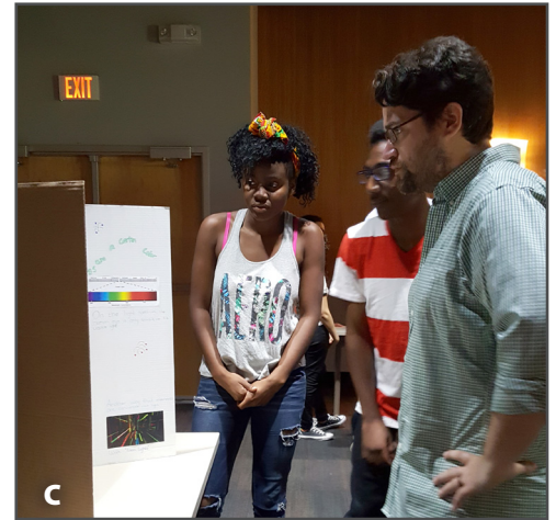
A - C. A group of 37 Young Scholars spent part of their summer vacation in classrooms, learning topics in Science, Technology, Engineering and Math (STEM). They presented poster sessions to administrators and the UC campus at the conclusion of the classes. 7/28