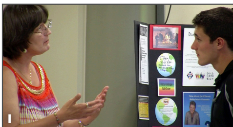
D - I. It was a full house for UC's Transfer Orientation sessions! The College expects 200 transfer students this August.